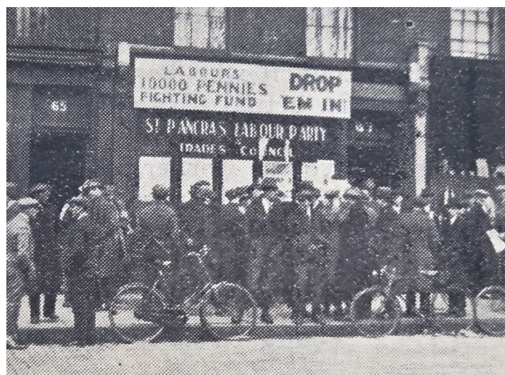
— St Pancras Council of Action outside 67 Camden Road. —

“There was a great deal of activity at the St Pancras Trades Council Headquarters with a constant toing and froing of people involved in co-ordinating strike activity and keeping in touch with the situation at the rail depots and other workplaces. Some come to collect the bulletin for distribution.”